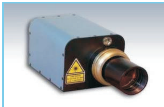
FR 3000 Pyrometer

Spot diameter: 1:50 (20mm from a distance of 1 meter) Various optics is available upon request.